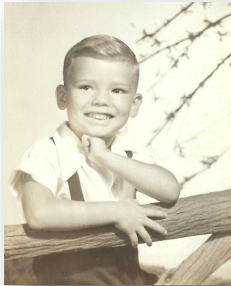
Do you recognize this little one?

Send your pictures to Carol at lcl@pa.net today and maybe you will be featured in one of our upcoming newsletters! Answer can be found on page 9.