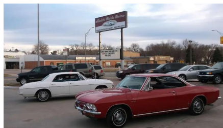
The Exterior of Shade's Classic Cars. Photo: Chris Shade

Taken from: https://newstocheck.com/automotive/8-kids-and-80-corvairs-how-one-mans-entire-world-revolves-around-the-rear-engined-chevy/ Submitted by Joe Darinsig