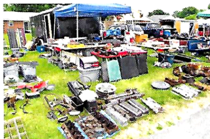
■ Is it possible to find good swap meet vendors among the... well, not so good? Yes!

This guy's got very interesting stuff: an old style racing helmet with an old Yenko sticker, a vintage dealership merchandising