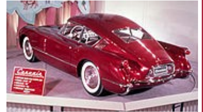
1954 Chevrolet Corvette Corvair Motorama Show Car

The chassis and power train of the Corvair was strictly Corvette. Sluggish sales of the 1954 Corvette deterred