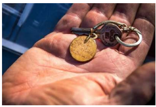
Nicol holds the original keys to the 1966 Corvair Sprint he drove in high school, when the car was 5 years old. After purchasing the exact car 43 years later, the keys still start the vehicle.