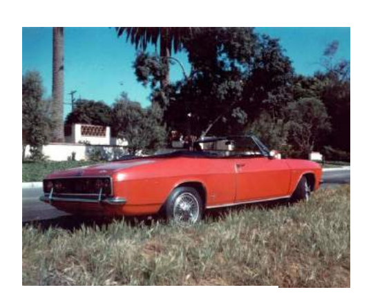
The 1966 Corvair Sprint in the condition Nicol last saw it 43 years ago.