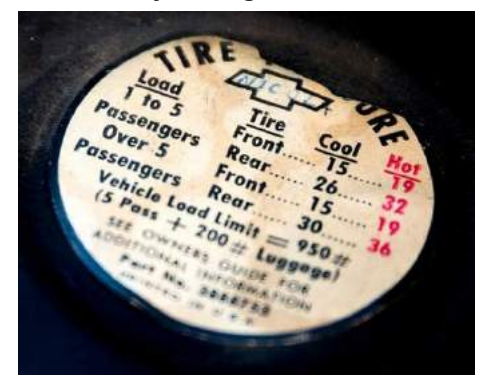
Nicol's signature is still on a tire pressure sticker in the Corvair's glovebox, 43 years later.