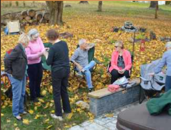
Pizza Party Photos Inside