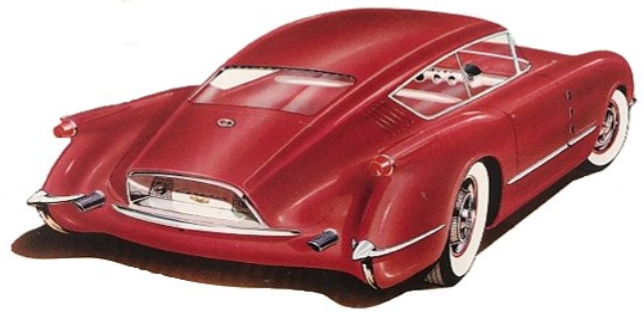
The Chevrolet Corvair