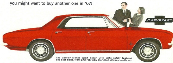
The Corvair Monza Sport Sedan with eight safety features like seat belts, front and rear row standards. Always buckle up.

We think we know what you'll hear when you ask around about Corvair. Praise for Corvair's independent four-wheel suspension. Comments on how Corvair turns, parks and maneuvers. Compliments for Corvair's one-of-a-kind styling. Awe for its great rear-engine traction. Buy one now and you'll like it so well you might want to buy another one in '67!