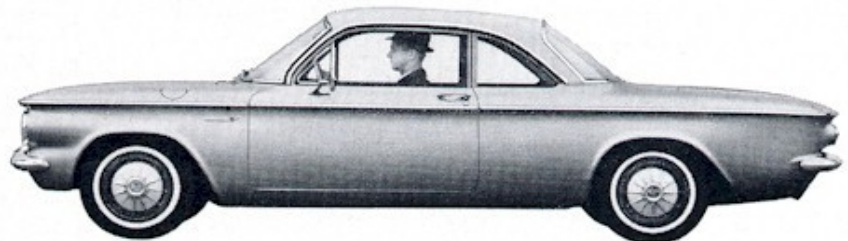
The lively Corvair 700 Club Coupe

Corvair, you know, is still the most advanced car in the land—and we've had a solid year to refine those engineering marvels: independent suspension all round. . . . air-cooled aluminum engine in the rear and all the rest. Check into it—and while you're at your dealer's, get a load of that Greenbrier Sports Wagon!